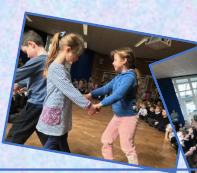
Opera Performance of Hansel and Gretel