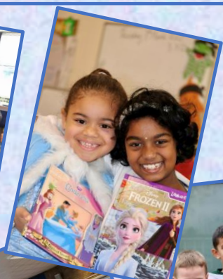
Dressing Up for World Book Day