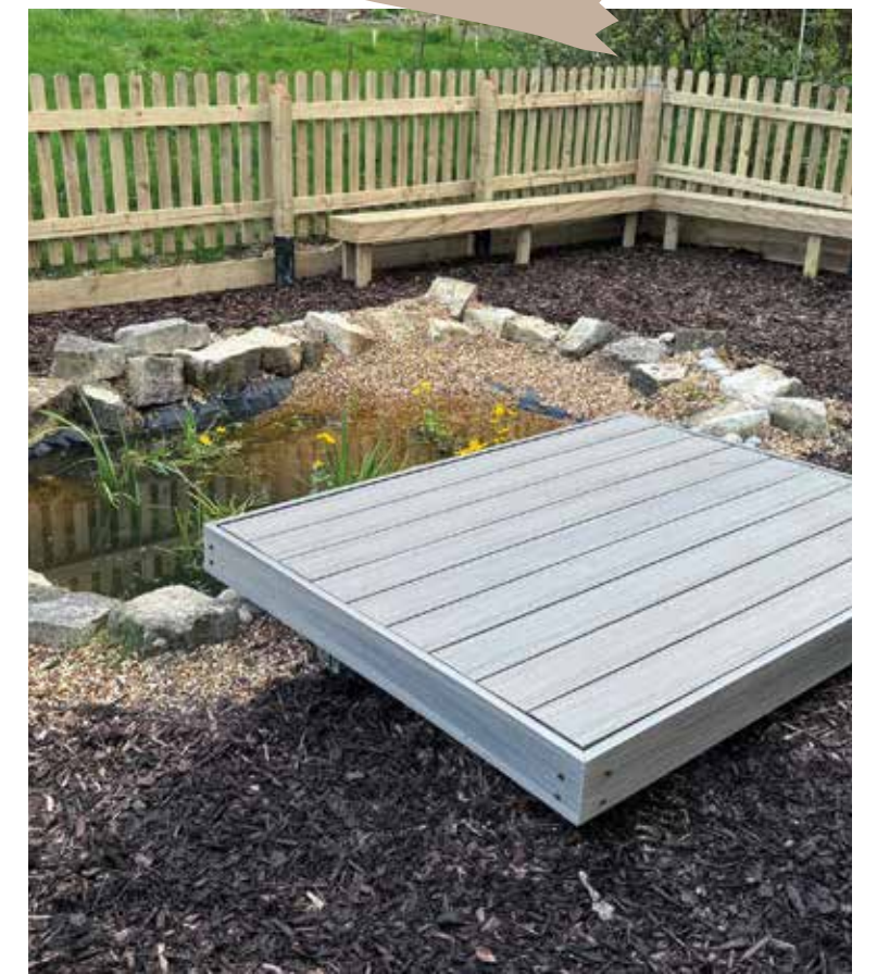
THE DIPPING PLATFORM