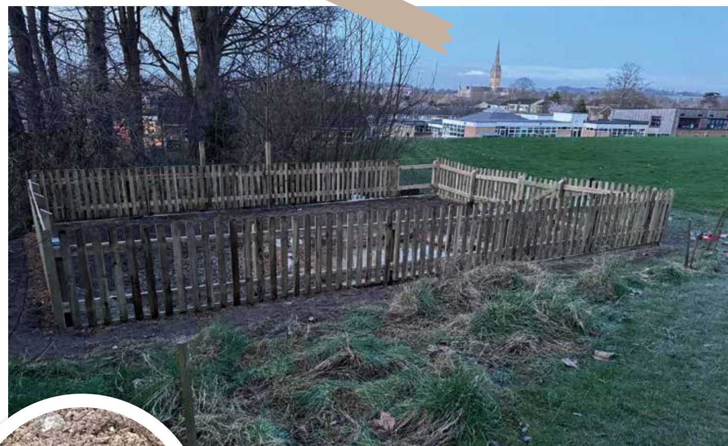
END OF WEEK 2