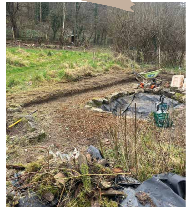
END OF WEEK 1