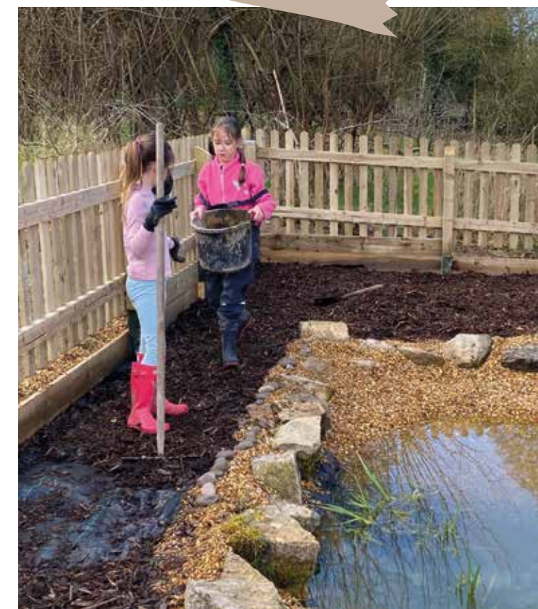
LEAVING THEIR LEGACY