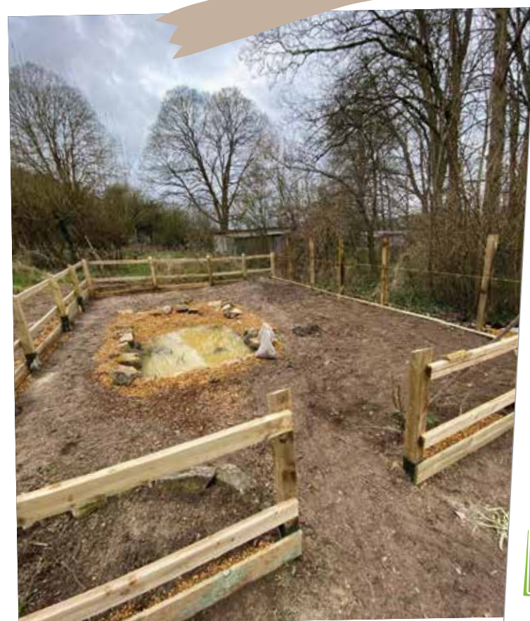
SECURING THE SITE