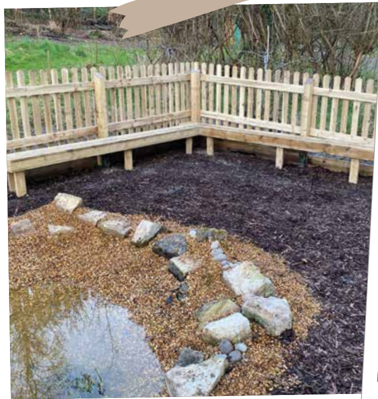
BENCH SEATING FOR THE CHILDREN