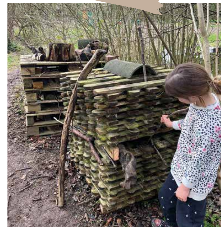
CHECKING THE NEW BUG HOTEL