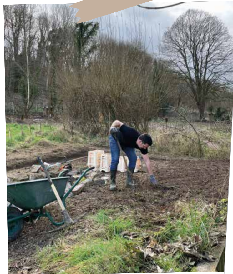
CLEARING THE SITE