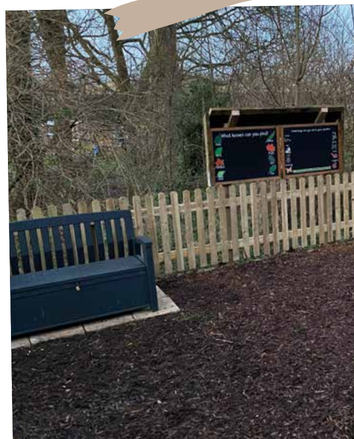
THE TEACHING ZONE