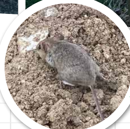
THE FIRST RESIDENT MOVING IN