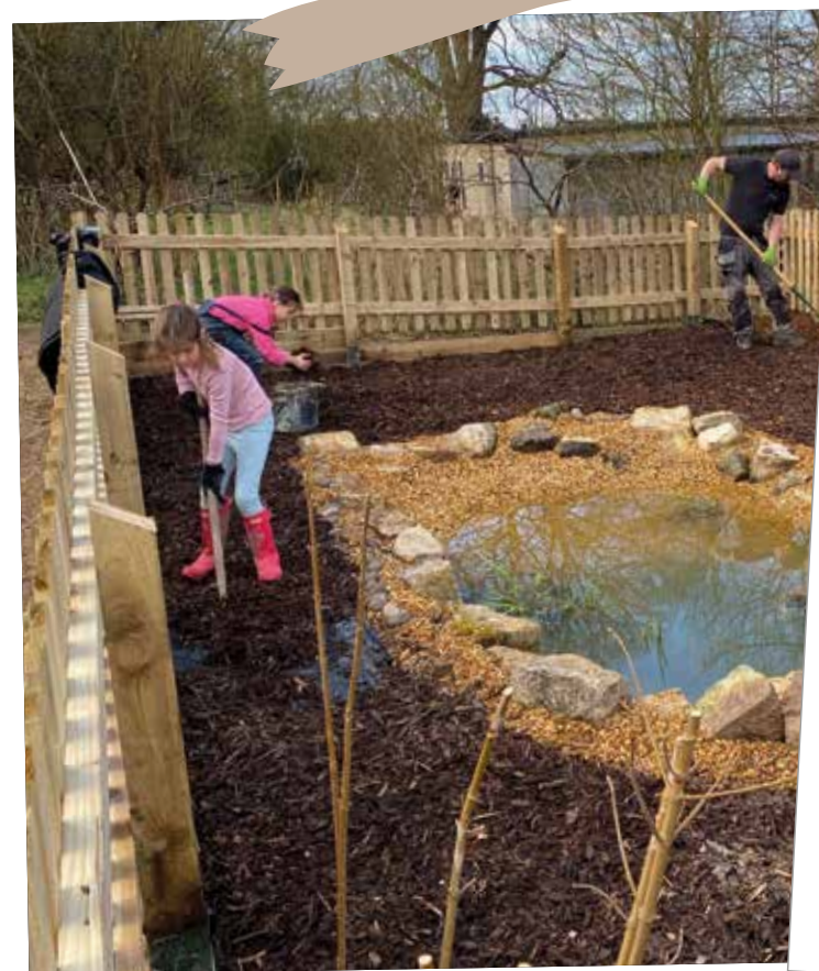
THE FINISHING TOUCHES